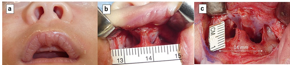
FIGURE 2: Operative findings.

(a) Appearance of the nostrils before surgery. (b) A sublabial approach was performed, and the pyriform aperture and nasal process of the maxilla were exposed. (c) The nasal process of the maxilla was drilled on both sides with diamond burs to widen the pyriform aperture from 6 to 14 mm.