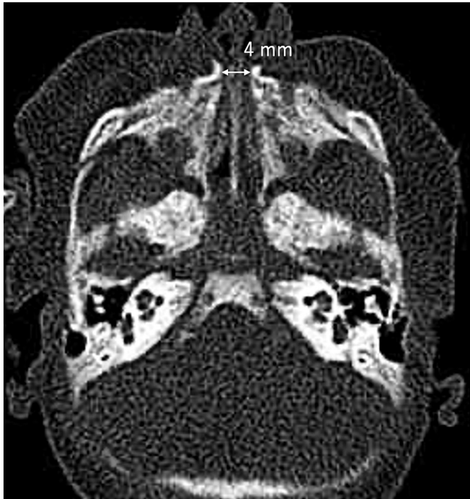
FIGURE 1: CT results on day 7 after birth.

aperture increased to 6 mm by day 56 after birth. However, decannulation on day 58 after birth was unsuccessful. Hence, we decided to surgically dilate the stenosis of the nasal aperture. In this period after tracheostomy, the patient also received swallowing and physical therapies. A No. 4 French nasogastric tube (O.D. 1.3 mm) (JMS, Hiroshima, Japan) was placed through the nostril on day 35, and the patient was fed through a bottle and nasogastric tube. Swallowing therapy consisted of feeding assessment and training and oral organ development assessments, including intraoral stimulation, non-nutritive sucking using a pacifier, and attempts to choose the best bottle nipple. His feeding ability was almost normal and direct breastfeeding was started on day 49. Physical therapy consisted of neurological assessment and support for motor development.