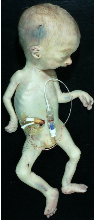
Figure 1. Autopsy findings in the proband. External examination demonstrates relative macrocephaly, dysmorphic facies, hypertelorism, micrognathia, and syndactyly of the third and fourth fingers on left hand.

rapid FISH analysis for select loci revealed three copies of chromosomes 13, 18, and 21 using LSI 13, CEP 18, and LSI 21, two copies of the X chromosome (CEP X), and one copy of the Y chromosome (CEP Y). A chromosomal microarray analysis (CMA), using the Affymetrix