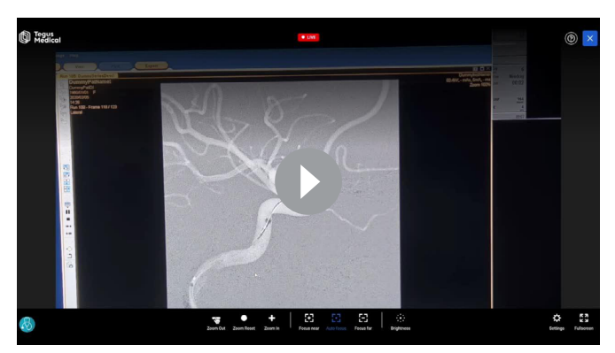
Video 1 Demonstration of the user interface and image quality of the Tegus system (reduced image quality for practicability purposes). Exemplary transmission of an angiography screen with prerecorded roadmap loops, displaying an aneurysm with a WEB device and the probing of an aneurysm with a guide wire (Traxcess 14, MicroVention, Aliso Viejo, California, USA; Excelsior SL10, Stryker, Kalamazoo, Michigan, USA). In the final section of the video, the preparation of a WEB device is shown (SLS6, 6.0×4.6 mm, MicroVention). The footage does not originate from the cases presented in this report.

Although the local interventionalists involved at the two distant cities had moderate to solid experience levels in WEB-based aneurysm treatment, procedural proctoring by a highly specialised neurointerventionalist was deemed helpful. On-site presence of a proctoring specialist was not possible because of the COVID-19 pandemic.