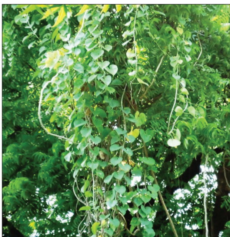
Figure 1: Guduchi collected from natural habitat with Neem tree

stem from the same plant with uniform maturity was selected for study, as it is reported to yield more Satva . [3]