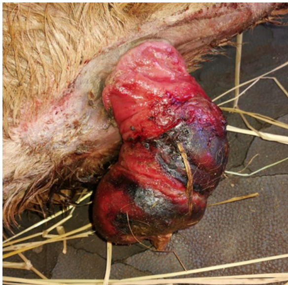
Fig. 1. Cattle calf aged 4 weeks old suffering from a rectal prolapse of grade IV.

a The classification was based on a previous study (Haskell, 2004).