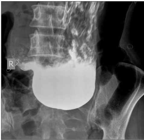
Figure 1: Barium study (erect) showed distended hypotonic stomach suggestive of prolonged gastric outlet obstruction