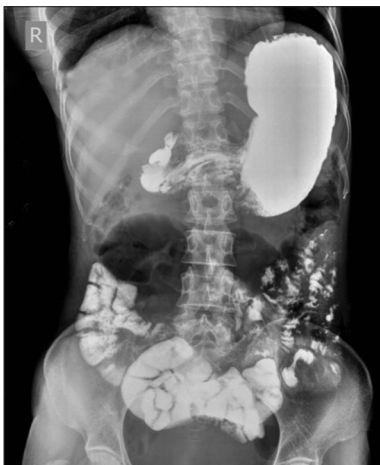
Figure 3: Barium study (performed after change of posture) shows passage of barium into the small bowel loops showing partial obstruction

syndrome to be 0.1-0.3%. [3] Approximately 0.013-0.78% of barium upper GI studies evaluating for SMA syndrome confirm the diagnosis. [4,5] Multidetector CT scan is the best modality for the diagnosis of SMA syndrome. [6]