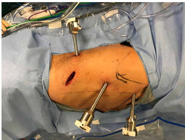
Figure 3 Chest phase port placement with extraction incision.

The patient is placed in a lateral decubitus position and the right thorax is entered through the sixth intercostal space, where an 8 mm port (10 mm port for SI system) is inserted for the robotic camera. A robotic port is then placed in the third intercostal space for robotic arm number 4 (XI system, arm 1 for SI system). A 4 cm incision is made at the ninth intercostal space, which serves as the access for the assistant (Figures 3, 4). An 8 mm robotic port is placed at the tenth posterior intercostal space for an additional robotic arm. The pleura over the azygos vein is incised and mobilized