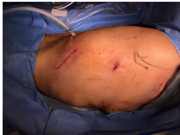
Figure 4 Chest phase port placement with chest tube.

completely with the hook cautery. The vein is transected with a vascular stapler. The esophagus is mobilized en bloc down to the gastroesophageal junction dissecting all visible lymph nodes in the periesophageal area, periaortic area, inferior pulmonary ligament, and subcarinal nodal basins. The specimen is then removed and checked for margin status. The esophago gastric anastomosis is created using a 25 mm anvil passed transorally (Orvil, Autosuture, Norwalk, CT, USA). After a nasogastric tube is brought down proximal to the newly created anastomosis, the chest is filled with saline and 40 mL of air is instilled into the proximal esophagus to check for anastomotic leaks. An omental patch is finally secured around the anastomosis.