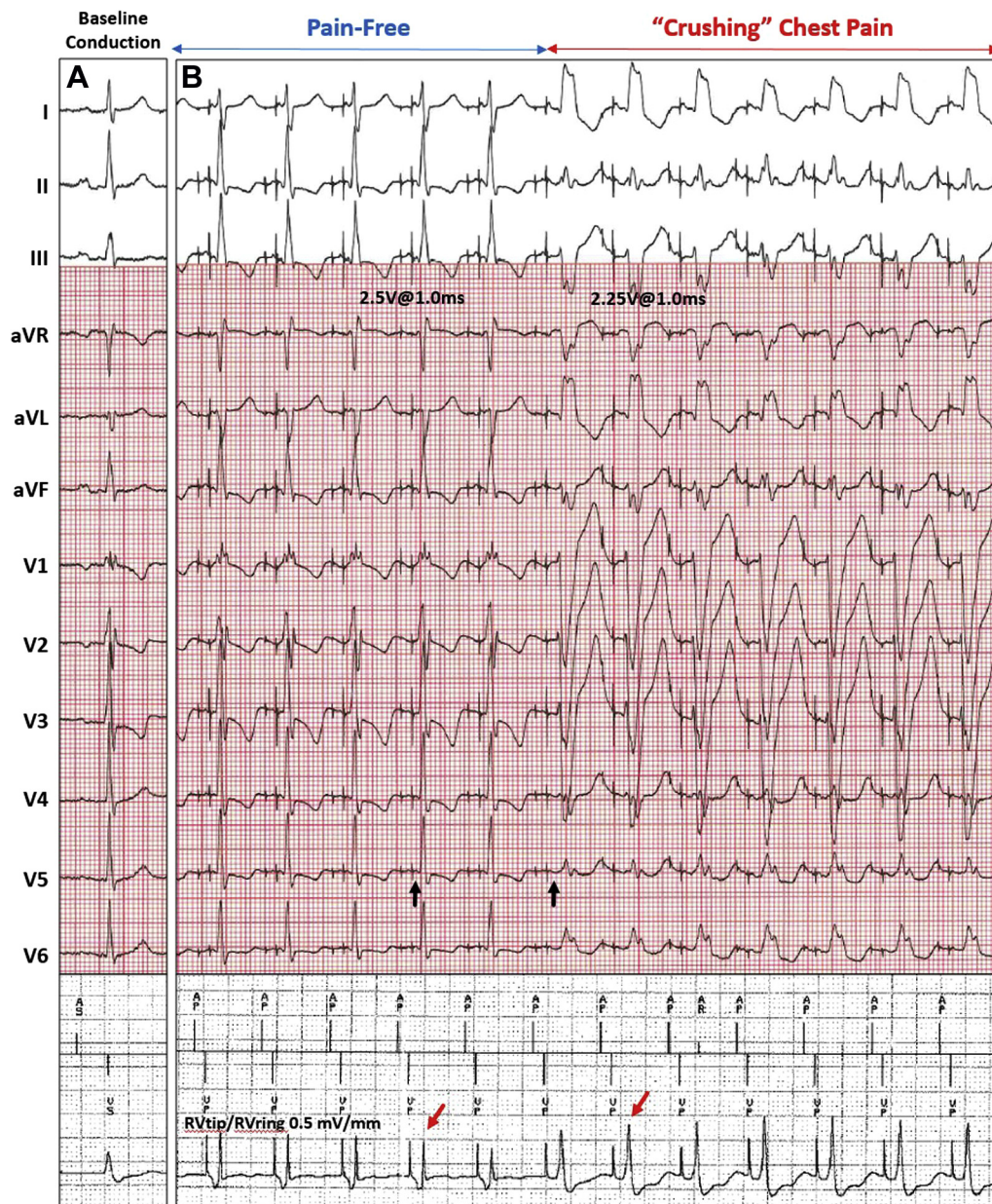
Figure 3 A: Baseline native QRS, which is narrow. B: Pacing at 2.5 V @ 1 ms results in selective His bundle pacing (HBP) with left bundle branch block (LBBB) correction, as evidenced by an initial isoelectric interval (black arrows) and a similar QRS morphology on 12-lead electrocardiogram. Note that there are subtle ventricular repolarization changes owing to a faster pacing rate. Pacing at 2.25 V @ 1 ms also results in selective HBP without LBBB correction and chest pain ensues. Identical responses were seen during both dual-chamber and ventricular-only pacing configurations. The selective nature of both manifestations is confirmed by a discrete local ventricular electrogram, as seen on the pacing lead (red arrows).

resolution of symptoms. By definition, nonselective His bundle pacing results in activation of the His bundle as well as the local RV myocardium to different degrees. The narrow QRS complex and output-dependent pacing morphology in this case suggests that the normal conduction system is being activated early on and is responsible for activation of the lateral left ventricular (LV) wall, consistent with prior work. 14