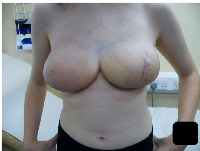
Fig. 3. 2 weeks post-operation.