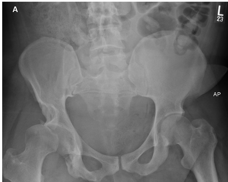
FIGURE 3: AP X-ray of the pelvis.

This image shows superior subluxation of the right femoral head in the acetabulofemoral joint. Noted is the shallow nature of the right acetabulum compared to the contralateral side.