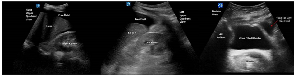
Fig. 1 – (A-C) Representative images of free fluid demonstrated on a FAST examination.

CPR, especially in hemodynamically unstable patients. We report a case of hemoperitoneum caused by liver laceration following cardiopulmonary resuscitation.