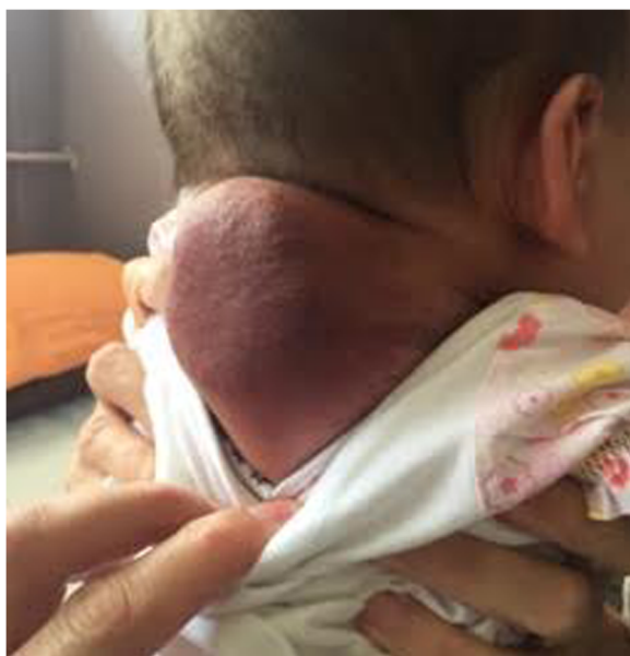
Fig. 1 Soft tissue tumor of the posterior region of the neck in a 4.5-month-old baby girl

On admission, the child was conscious, body mass (BM) 5900 gr, with adequate spontaneous and provoked activity, afebrile with a body temperature (BT) of 36.7^\circ\text{C} , and with normal respiratory and heart rate; she was acyanotic, anicteric, and had normal osteomuscular status. Her vital signs were in the normal ranges. In her neck, in suboccipital region and medially, existed a tumor of hemangioma type, size 6 \times 6 cm, of firm consistency. The skin above the tumor was cyanotic, with petechiae, without signs of devitalization. Other physical findings were normal.