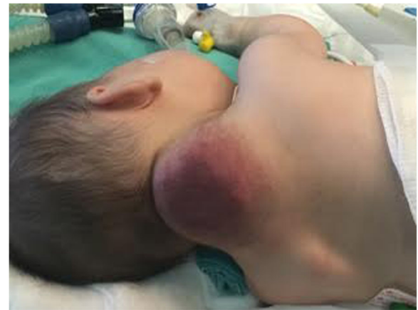
Fig. 4 Preoperative view – the reduction in tumor size due to treatment with propranolol

and laboratory tests revealed a low platelet count. Compared with previous clinical examination, the tumor was larger and was 8 × 8 cm in size. The values of some laboratory parameters were: WBC 9.5 \times 10^9/l ; RBC 3.2 \times 10^{12}/l ; Hgb 90 g/l; platelets 9 \times 10^9/l ; PTT 13.5 seconds; INR 1.05 seconds; APTT 36.4 seconds; fibrinogen 2.1 g/l; and D-dimer 12.7 mg/ml. Urine culture was sterile, while Staphylococcus aureus was isolated from chemo-culture. A cardiologist was consulted. Her electrocardiogram and echocardiographic findings were normal.