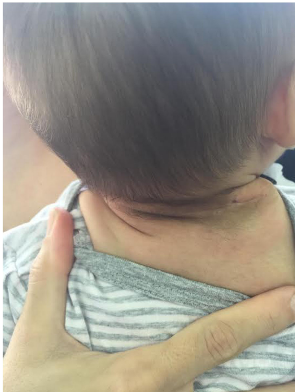
Fig. 7 Postoperative view 4 weeks after surgical treatment

reviews on good [10, 11] and poor [12, 13] responses to propranolol, when used in addition to a steroid or vincristine treatment for KMS.