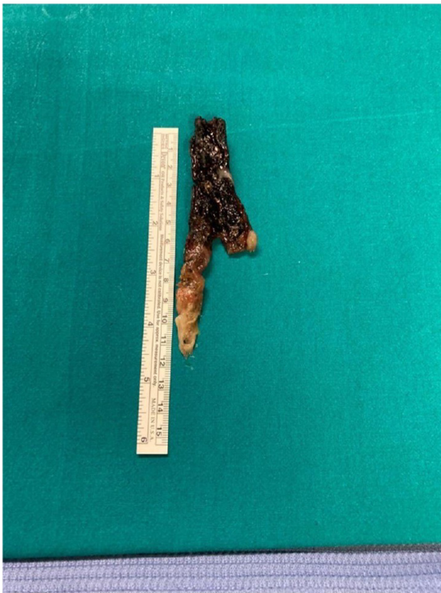
FIGURE 1 Tracheal plug. Bulky tracheal plug removed from patient #5, the procedure was performed by urgent rigid bronchoscopy

The present cases highlight the need for close interdisciplinary working and communication in the management of airway complications of COVID-19 infection. Careful joint planning between