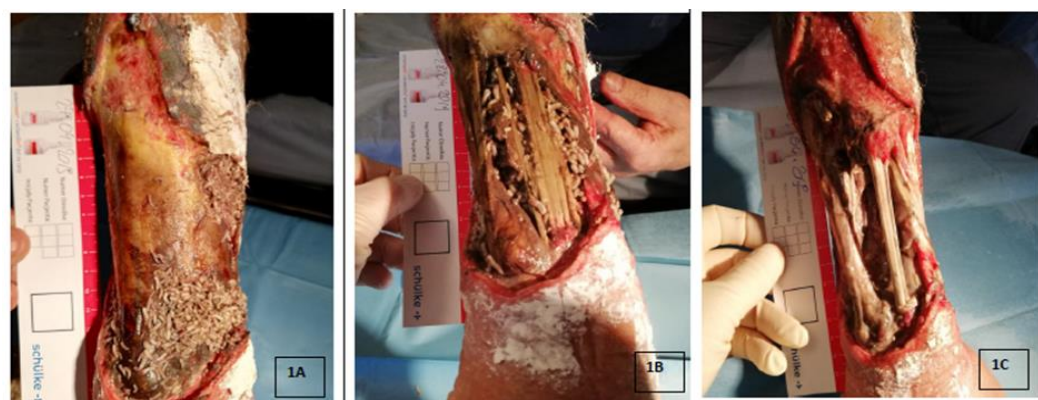
Figure 1. Process of debridement of a necrotic forearm wound with Lucilia sericata larvae; the wound has an area of nearly 200 cm 2 , 100 free-range Lucilia sericata larvae from Biolab@culture were used. 1A. 24 hours since the larvae application, 1B. 48 hours since the larvae application, 1C. The condition after the removal of the larvae from the wound (over 72 hours). Note the exposed damaged ulna, and the extensor digitorum muscles. During therapy, pain sensations at the level of 2–3 Numeric Rating Scale (NRS).