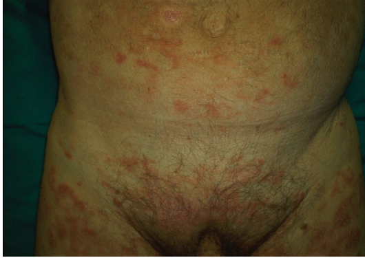
FIGURE 1: Extensive eruption of erythematous red-brown papulovesicles lesions scattered over the abdomen and the lower extremities.