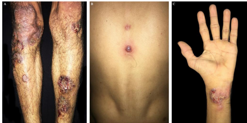
Figure 2 (A and C). Erythematous nodules ulcers with violet brownish, well-defined, slightly raised borders, cribriform in the middle on legs and hands. (B) Violet papule with central vesiculation on the back dorsum.