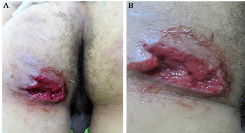
Figure 1 (A and B). Deep ulcer with irregular, well-defined borders, piercing, mild perilesional erythema, clean fundus, granular, without exudation on the left gluteus.