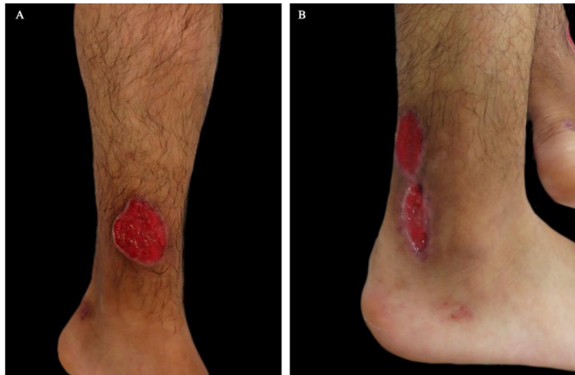
Figure 4 (A and B). Superficial ulcers, round in shape, well-defined, raised and slightly violet borders on both legs.