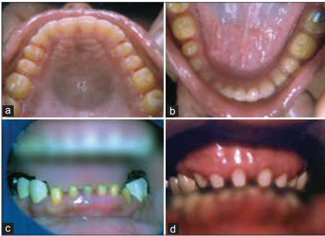
Figure 4: Posteriors after tooth preparation (a) maxillary (b) mandibular and anteriors after tooth preparation (c) mandibular (d) maxillary.