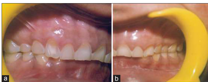
Figure 3: (a and b) Pre-operative photo showing worn out teeth and severe deep bite.