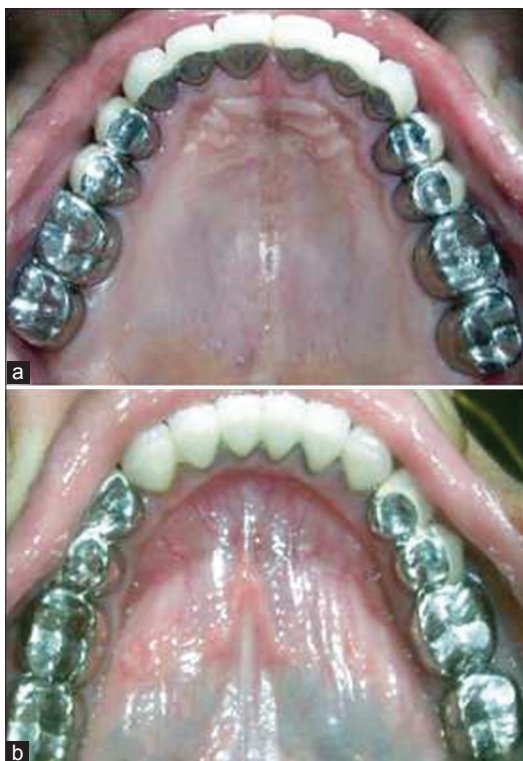
Figure 5: Definitive crowns after cementation in (a) maxillary and (b) mandibular arch.

reasons. First, one has to rule out the occurrence of systemic diseases that may accompany enamel hypoplasia. Secondly, precise diagnosis enables genetic counseling for affected families. Finally, an accurate diagnosis helps in recognition of the condition so preventive measures can be provided early. Treating a patient with AI is important for functional and psychosocial reasons. Some patients need only oral hygiene instructions while others need extensive dental treatment. The clinician must watchfully balance the esthetic requests of the patient, strength of the restoration, protection of the remaining teeth and long term prognosis of the treatment. 6 Adhesive