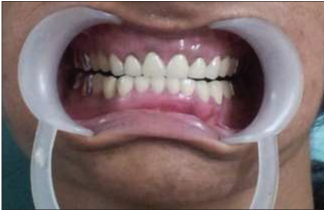
Figure 7: 8 th year follow-up photo showing good anterior guidance.