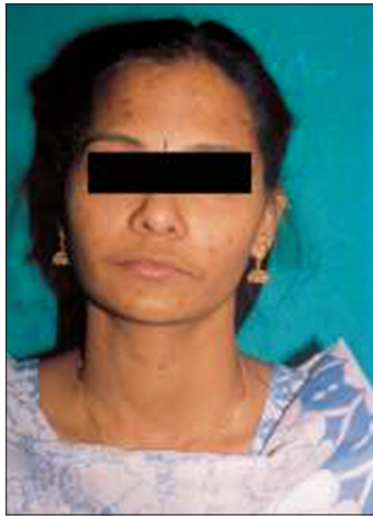
Figure 1: Pre-treatment photograph.