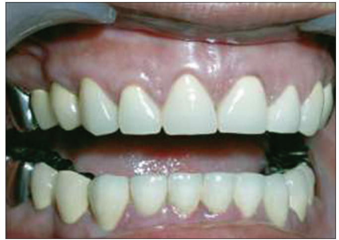
Figure 6: Definitive crowns in place.

reasons. First, one has to rule out the occurrence of systemic diseases that may accompany enamel hypoplasia. Secondly, precise diagnosis enables genetic counseling for affected families. Finally, an accurate diagnosis helps in recognition of the condition so preventive measures can be provided early. Treating a patient with AI is important for functional and psychosocial reasons. Some patients need only oral hygiene instructions while others need extensive dental treatment. The clinician must watchfully balance the esthetic requests of the patient, strength of the restoration, protection of the remaining teeth and long term prognosis of the treatment. 6 Adhesive