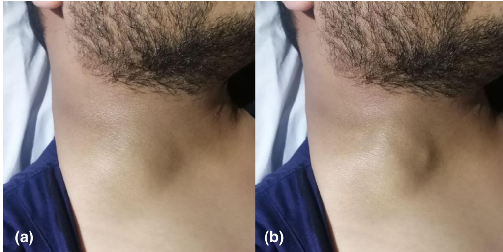
Fig. 1 – Four-centimeter right external jugular pseudoaneurysm as seen on physical exam before (a) and after Valsalva (b).