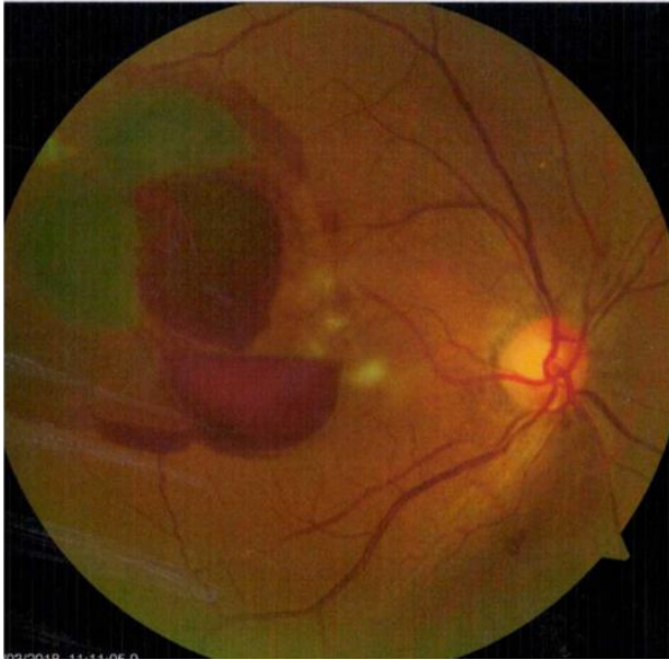
Fig. 1 Fundus photo showing a ruptured RAM with haemorrhage at all levels