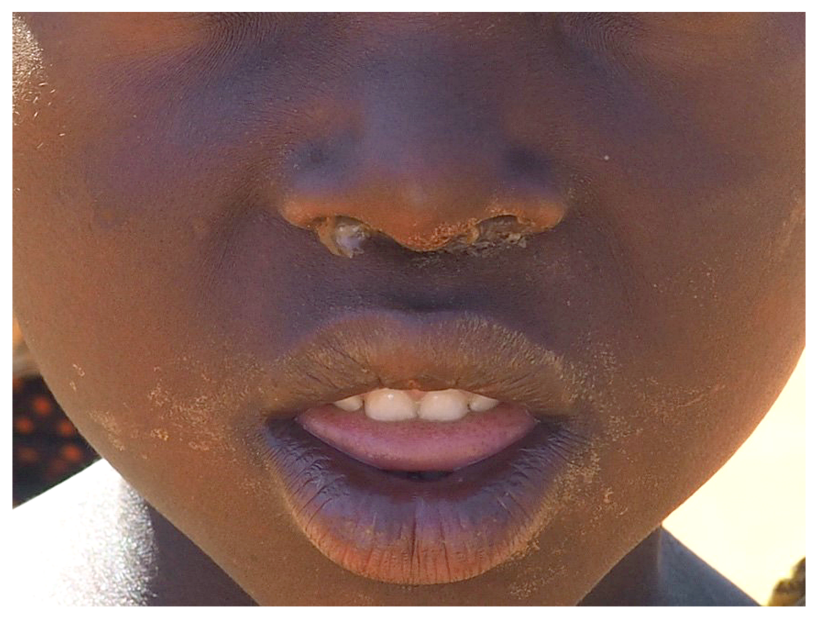
Fig 2. Example of a minimal amount of nasal discharge. https://doi.org/10.1371/journal.pntd.0006019.g002