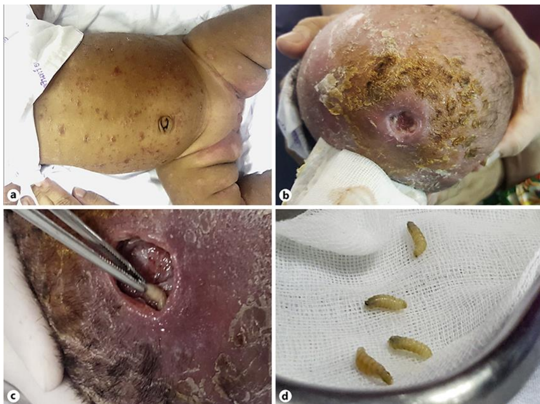
Fig. 1. Clinical photographs. a Skin rash on the trunk and extremities. b Skin lesions and ulcer on the scalp. c Maggot removed from the wound. d Larvae.