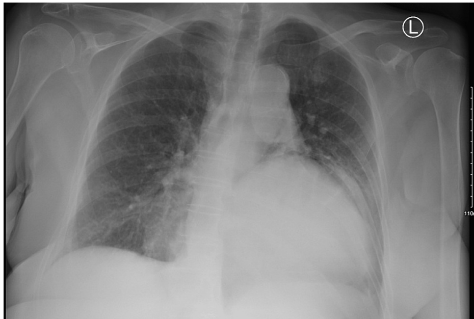
FIGURE 1: Radiograph chest posteroanterior (PA) view shows a left basilar opacity representing bowel gas suggestive of a hiatal hernia

Chest X-ray, as seen in Figure 1, revealed a left basilar opacity representing bowel gas suggestive of hiatal hernia.