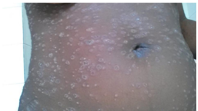
Figure 3 Widespread, central darkening, maculo-papular (and painful) rashes.