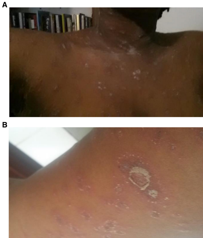
Figure 1 (A) Rashes initially misdiagnosed as a fungal infection. (B) Worsening at some areas, forming vesicles and appear bullous.

obvious mucocutaneous lesions and the urine output remained normal.