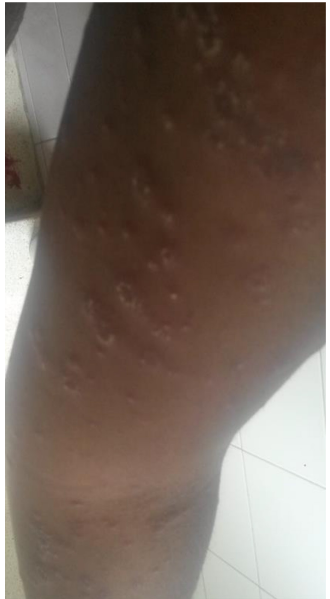
Figure 2 Worsening of the rash and spreading to other areas in the back and thighs.

These cutaneous features may be the result of exaggerated cytokine responses (cytokine storms), resulting in erythema multiforme. This has previously been reported. 1-5 The varicella infection (which was confirmed by the attending physician due to a raised IgG antibody titre) in our view was coincidental and unrelated to the erythema multiforme, since only IgG antibodies were observed but not IgM. In our view,