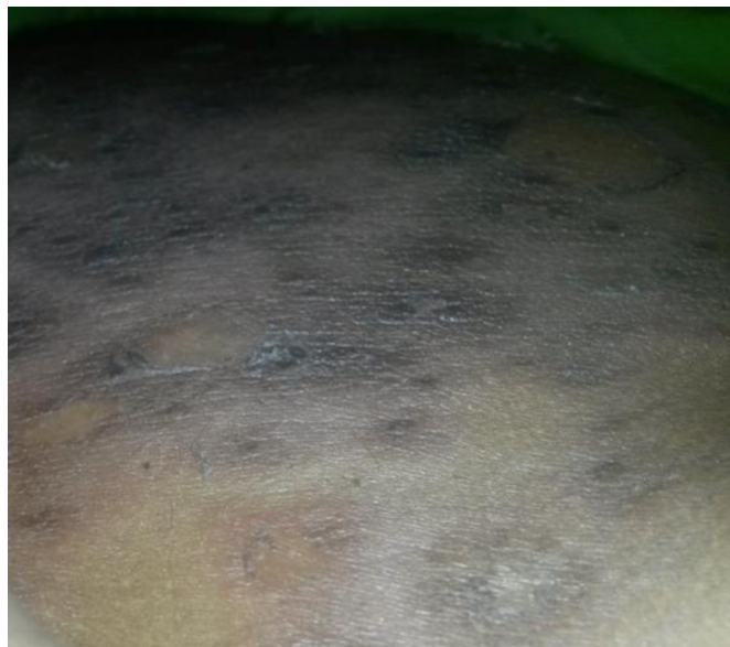
Figure 4 At some areas, the lesions were necrotic dark patches.

the erythema multiforme was caused by the COVID-19 infection and vaccination.