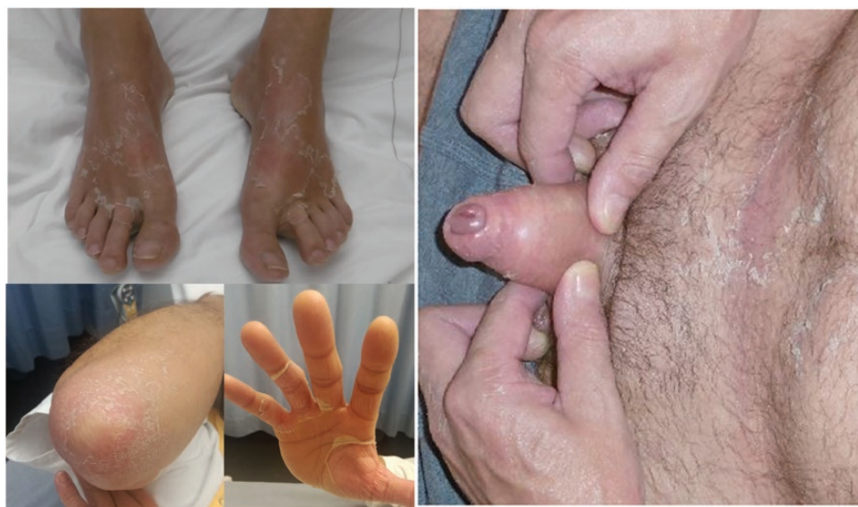
Figure 2. Clinical picture during episode 2 in hospital B: desquamating skin on feet, hands, and elbows. Swelling, redness, and scaling of genital area.

We performed a systematic literature review searching for records reporting cases of Kawasaki-like disease associated with leptospirosis. A professional librarian ran a literature search in