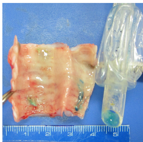
Fig. 3 - Traditional endotracheal tube (TETT) at trachea (post mortem).

control group), and between times in the experimental group through the paired Wilcoxon non-parametric test. A normality test was performed.