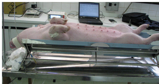
Fig. 4 - Overview procedure.

Statistical analysis regarding blood gas data confirmed the absence of hypoxia when both tubes were compared. This answered the question regarding the aforementioned device in terms of its effectiveness on the lung gas exchange, at least in a healthy body. It is relevant to point out that this study was