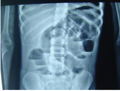
FIGURE 1: Abdominal X-Ray indicated loop distention.