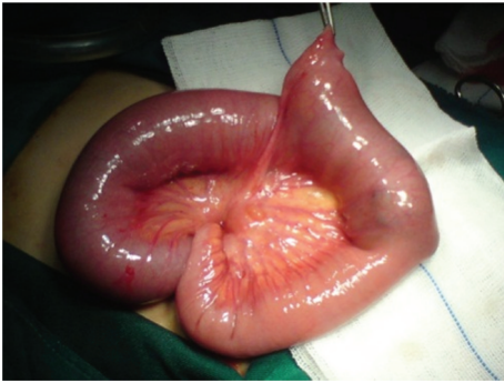
FIGURE 2: Distended intestinal loops after diverticulum—mass effect.

orange impacted at the diverticulum, extending as far as 5 cm after the diverticulum and causing obstruction at this point (Figure 4). Histopathology reported no ectopic tissue. After the surgery, the parents mentioned that the child had eaten large quantities of orange 2 days ago.