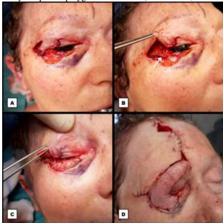
Fig. 2: First stage of the periocular reconstruction. A: Intraoperative photograph showing the modified myocutaneous Tenzel flap advanced into the defect of the upper eyelid to reconstruct the anterior lamella. Posterior to this flap lie the superior component of the Y-shaped periosteal and temporal fascia sling, as well as the advanced palpebral mucosa which is sutured to the inferomedial border of the flap. B: Intraoperative photograph showing the inferior component of the medially hinged periosteal and temporal fascia sling (arrow) by elevating the modified Tenzel flap with forceps. C: Intraoperative photograph showing the autologous cartilage graft from the right concha sutured into the defect of the lower eyelid to reconstruct the posterior lamella. The modified Tenzel flap is elevated with forceps. Posterior to the cartilage graft lies the advanced palpebral mucosa which is sutured to the superior border of the graft. D: Intraoperative photograph showing the interpolated paramedian myocutaneous forehead flap transposed onto the cartilage graft to reconstruct the anterior lamella of the lower eyelid. Conventional closure of all donor sites with a small frontal defect remaining, left open to heal secondarily.

Vicryl Rapide® polyglactin 910 6-0 (Ethicon US, LLC) sutures for the skin (Figure 2).