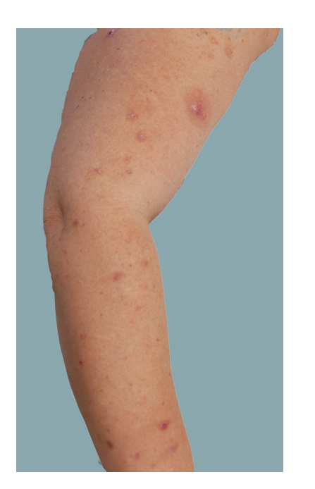
Fig. 3. Prurigo of pregnancy: excoriated, scaly, erythematous papules on the extensor surfaces of the upper extremities in patient 7.

Fig. 2. Prurigo of pregnancy: excoriated, erythematous papules on the extensor surfaces of the lower extremities in patient 7. Postinflammatory hyperpigmentation is noted. Patient had a satisfactory response to narrowband ultraviolet light B.