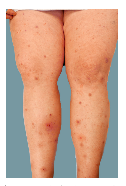
Fig. 2. Prurigo of pregnancy: excoriated, erythematous papules on the extensor surfaces of the lower extremities in patient 7. Postinflammatory hyperpigmentation is noted. Patient had a satisfactory response to narrowband ultraviolet light B.