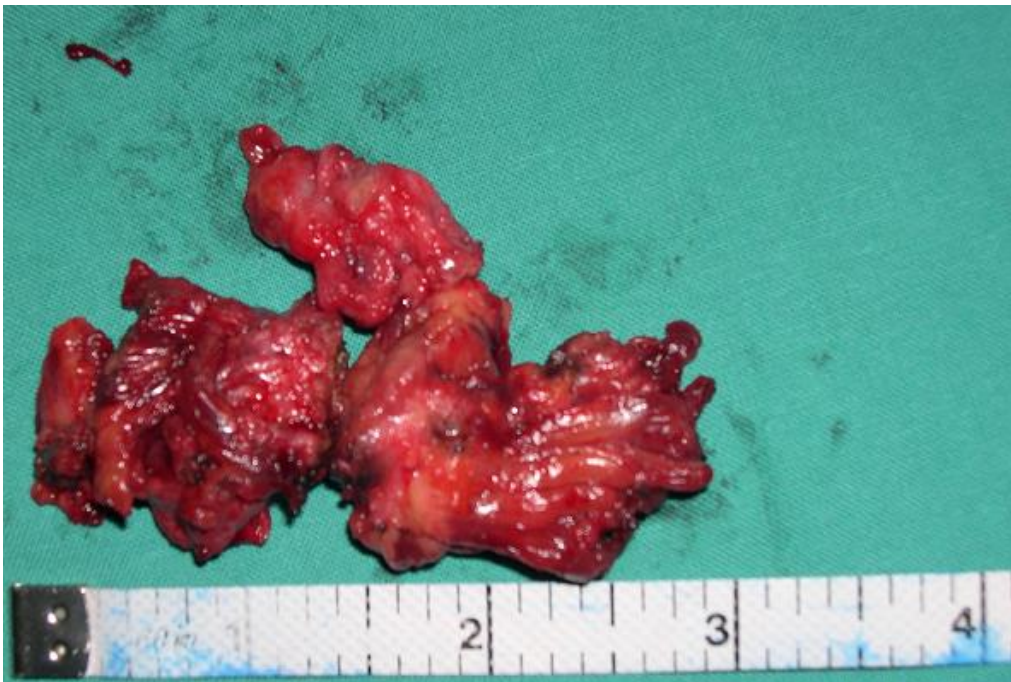
Figure 1: fibromuscular tissue blocks of the rectus abdominis muscle with endometriosis foci (our case)