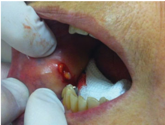
Fig. 1 Biopsy showing the yellowish coloration and hard consistency from right buccal mucosa.

To determine the patient's past medical history, a slide review was requested, which confirmed the previous histopathologic results. The confirmation of the previous facial filling was stated by the patient's caregiver, who said that the patient had facial plastic surgery 20 years before in a private clinic, which explained the lack of this information on the patient's medical records in our hospital.