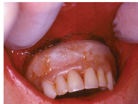
FIGURE 3: The removable denture was temporarily relined with a soft acrylic material until the bottom of the vestibular deepening. Patients were advised to keep the denture in mouth during the 6 weeks of post-op.

2.3. Surgical Procedure. We used a \text{CO}_2 laser machine (10.6 \mu\text{m} ) and all treatments were performed in one session. All reported patients were healthy without high-risk cases. Before each surgery, a local anesthesia (articaine with vasoconstrictor) was made. All medical staff wore specified glasses to protect their eyes against \text{CO}_2 laser beam. Patient wore protective eye glasses, or wet and sterile compressive gauzes