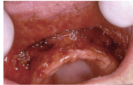
FIGURE 2: View of the operated site during surgery. The site is bloodless. Neither suture nor graft was necessary.