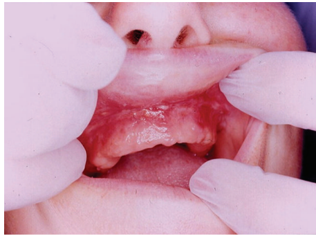
FIGURE 4: View of the healed site after 4 weeks post-op. The vestibular lengthening is stable. The healing of the crest was satisfactory.

to increase crest length. The defocus irradiation mode was only used to provoke the coagulation of bleeding areas. The tissue carbonization was gently removed from the operated tissue surfaces. The wound was left without any make-up and without wound dressing.