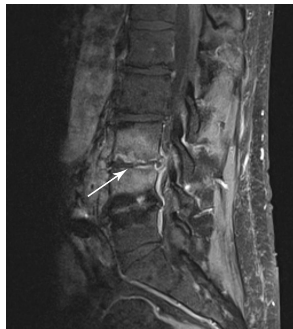
Fig. 1 Magnetic resonance imaging (MRI) of the lumbar spine demonstrating discitis and vertebral osteomyelitis. T1 post-contrast sagittal MRI demonstrating enhancement at the L3–4 intervertebral disc space with erosions in the adjacent endplates (arrow)

On admission, a temperature of 37.2 °C, heart rate of 74 beats per min, blood pressure of 129/67 mm Hg, and body-mass index of 32.7 were observed. On examination, there were multiple dental amalgam fillings and a 3/6 systolic murmur best appreciated in the aortic region, which was stable from prior. The remainder of the examination, including a focused neurologic, musculoskeletal, and dermatologic assessment, was normal. Basic laboratory tests