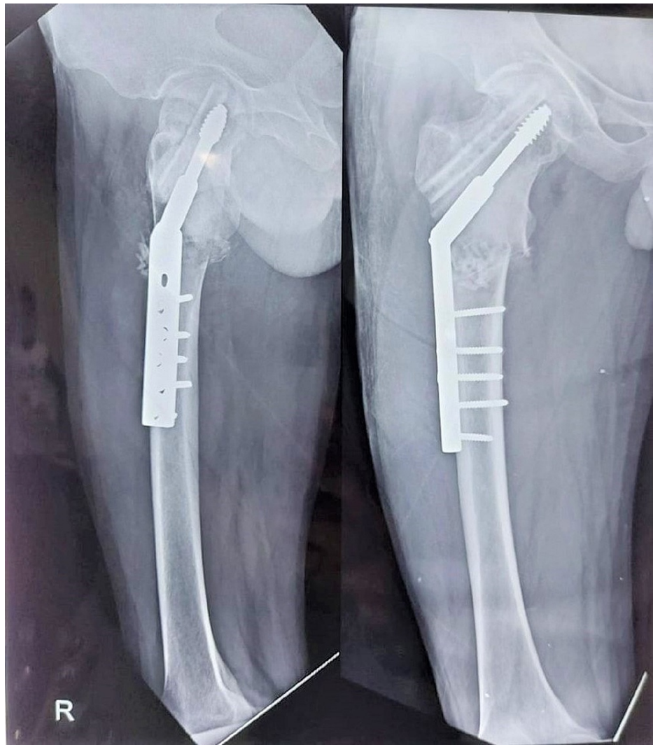
FIGURE 2: Immediate postoperative x-ray

The patient was followed up in the outpatient department (OPD), and x-rays were taken. Radiological sign of healing was observed at three months. Partial weight-bearing was allowed at three months and full weight-bearing at six months with no restriction in the activity. After six months, the patient was able to perform all activities without any difficulty, and the shortening of 1.5 cm was compensated with footwear modification. No evidence of recurrence was noted in the follow-up x-ray (Figure 3).