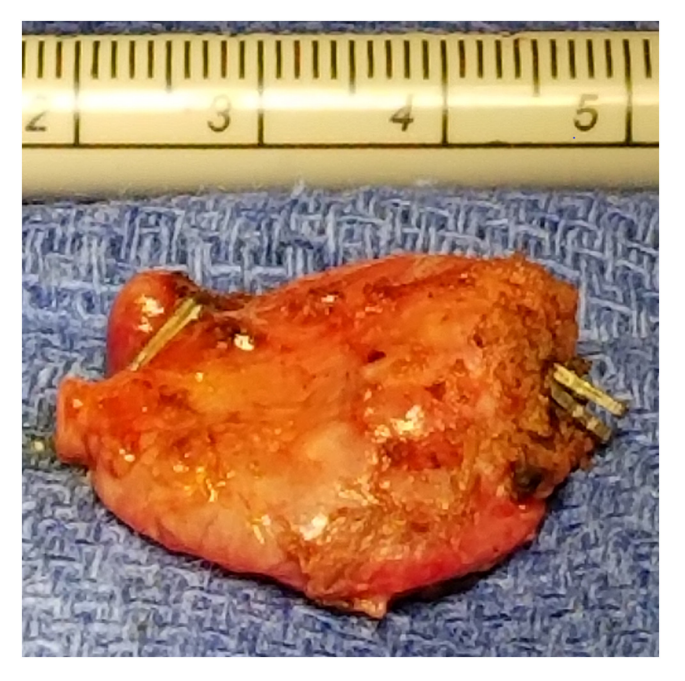
Fig. 4. Duplicate gallbladder post-resection. The duplicate gallbladder was resected in its entirety intact with the surgical clips denoting the origin of the duplicated cystic artery and duct.

The modern classification by Harlaftis takes embryological origin into consideration. Type 1 duplicate gallbladders arise from the same primordium but split later in development. These Type 1 gallbladders can often be identified by a common cystic duct that drains both gallbladders. The septate gallbladder is a single cystic structure separated into two by an involuting wall, though both gallbladders are joined at the base where they drain into a single cystic duct. In V-shaped variants the two gallbladders each have cystic ducts, which drain at a shared point along the common bile duct. In Y-