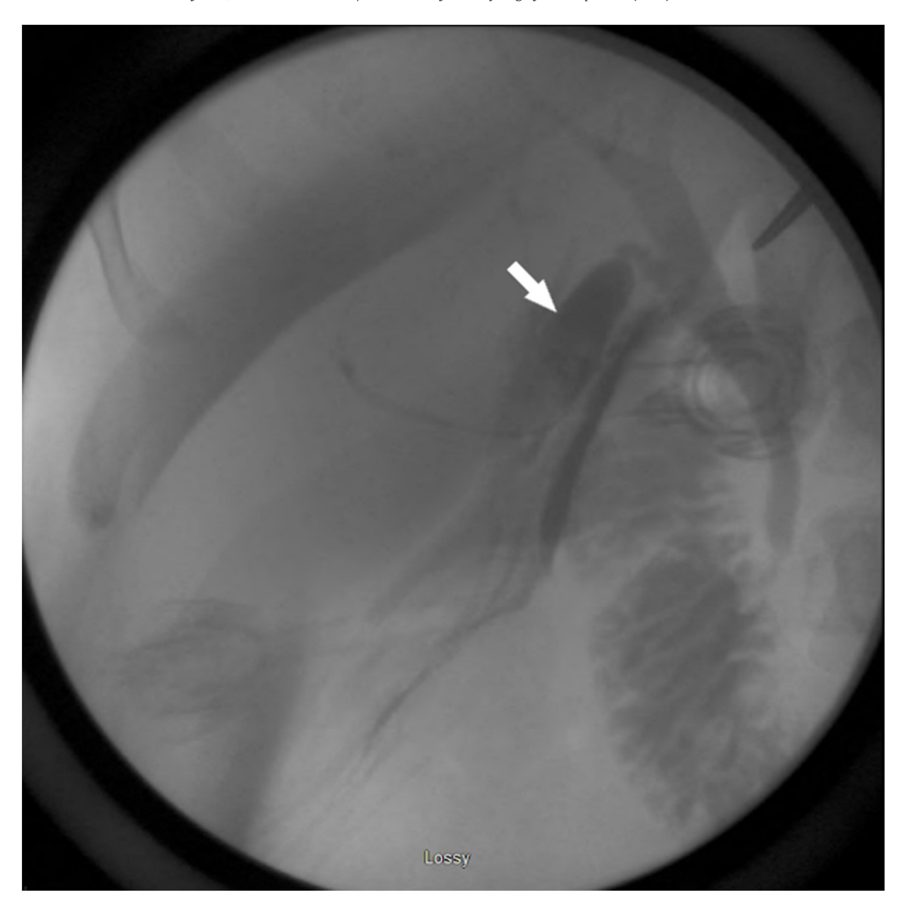
Fig. 1. Intraoperative cholangiogram during index cholecystectomy. Contrast demonstrates a normal common bile duct and intrahepatic ducts. An additional cystic structure (arrow) contiguous with the common bile duct can be seen.

S.J. Pera, N. Huh and S.T. Orcutt / International Journal of Surgery Case Reports 65 (2019) 156-160