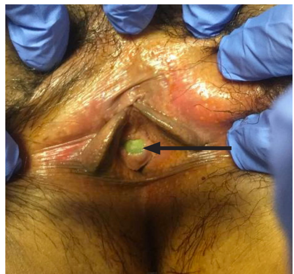
Image 2. Urethral calculus at the urinary meatus on external pelvic exam (arrow).

This case discusses a possible solution in an uncommon presentation with limited case reports and literature reviews of urethral calculi and management in the emergency setting.