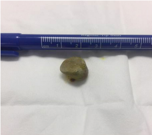
Image 3. 15-millimeter urethral calculus post-manual removal.

urethral calculus with forceps can be a definitive treatment resulting in complete resolution of symptoms and urinary retention while avoiding invasive procedures and possible associated complications.