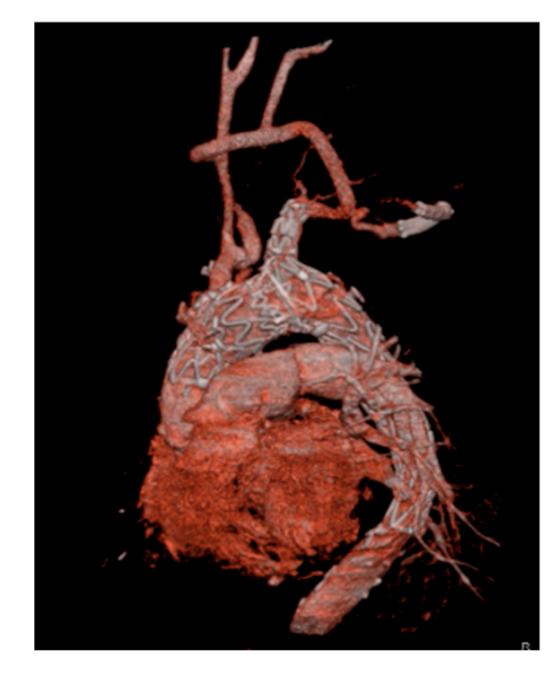
Figure 2. Three-dimensional reconstruction of a Nexus device with the side-branch positioned in the left subclavian artery. Patent and well-functioning supra-aortic debranching is clearly visible.

Tantalum radiopaque markers and an active locking mechanism facilitate the correct rotational and longitudinal deployment in order to achieve good sealing and to avoid coverage of the BCA branch. Like other off-the-shelf devices, different sizes of the components are available to fit the great majority of aortic anatomies.