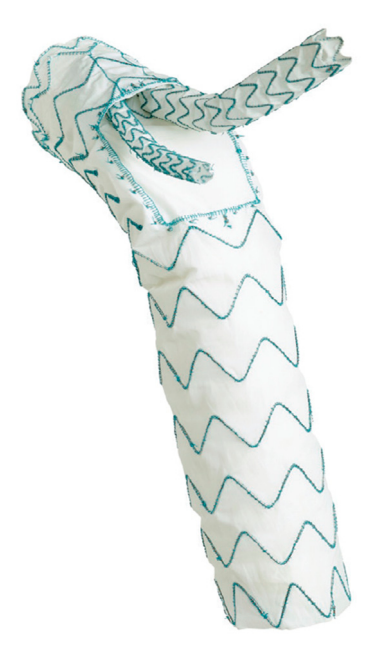
Figure 3. Relaybranch aortic arch system. The figure shows the stent-graft with two side-branches (for the brachio-cephalic trunk and for the left common carotid artery) that are positioned in the two tunnels of the upper window.

The RelayBranch Thoracic Stent-Graft System is a custom made, double branched endograft with a wide window on its superior portion to accommodate two inner tunnels for BCA and left common carotid artery (LCCA) connection (Figures 3 and 4).