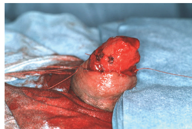
FIGURE 2: The penile skin is sutured proximally on to the corporal cavernosa leaving the corporal heads exposed for skin grafting.

Between 1998 and 2008, a total of 56 patients presenting with penile cancer underwent surgical treatment. Twenty five patients with a mean age of 60 (39–83) underwent penile preserving surgery with glansectomy and skin grafting performed by a single surgeon. Six out of 25 patients had CIS (carcinoma in situ). All the remaining patients had squamous carcinoma, the grade and stage of which are summarised in Table 1. Of the remaining 31 patients who underwent surgery, 26 had either partial or total penectomy with 4 managed by circumcision alone. Histology was squamous cell carcinoma in all but two patients who had melanoma.