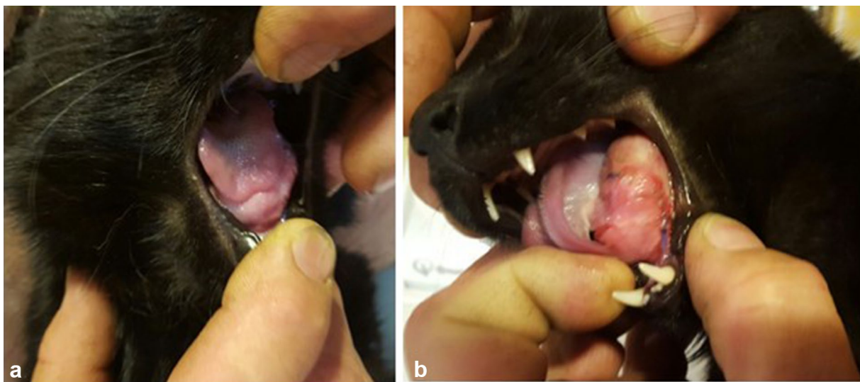
Fig. 1 Lateral views of the sublingual mass 5 days after the biopsy ( a right, b left). A 2-year-old, male, Domestic Shorthair cat had a multilobulated, sublingual mass present for 3 months. Sublingual pythiosis was diagnosed following histopathological examination from a biopsy specimen

The identification of the fungal-like organism as P. insidiosum was carried out by polymerase chain reaction (PCR) and amplicon sequencing using DNA extracted from formalin-fixed paraffin-embedded tissue [12]. PCR was carried out using the Expand Long Template PCR System (Roche, Indianapolis, IN, USA) with oligonucleotide primers that amplify the complete ribosomal Internal Transcribed Spacer 1 (ITS1) region. The resulting amplicon was purified by spin chromatography (QIAquick PCR Purification Kit, Qiagen, Valencia, CA, USA) and nucleotide sequence determined using BigDye terminator chemistry with the amplification primers at the University of Missouri DNA Core Facility. Sequence analysis disclosed the identity of the pathogen as P. insidiosum .