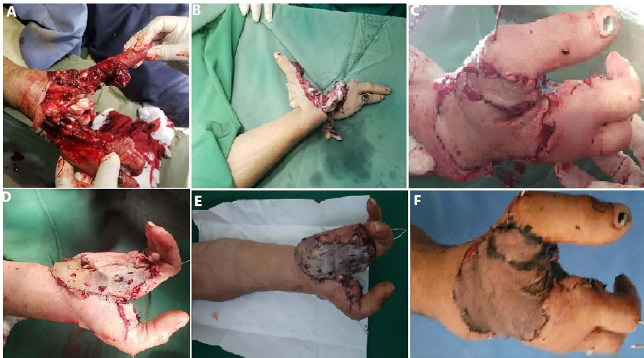
Figure 4 Severe injured proximal right hand with multiple fingers amputation and devascularization (A and B). Replantation and bone fixation by K-wires (C). Postoperative appearance with good color, warm, normal capillary refilling (D and E). 5th-week postoperative appearance (F).

included 6 (28.6) digits at the MCP joint, 3 (14.3%) at the shaft of the proximal phalanx, 3 (14.3%) at the PIP joint, 4 (19.0%) between the distal insertion of the FDS and the DIP joint 5 (23.8%) proximal interphalangeal joints (Figure 4).