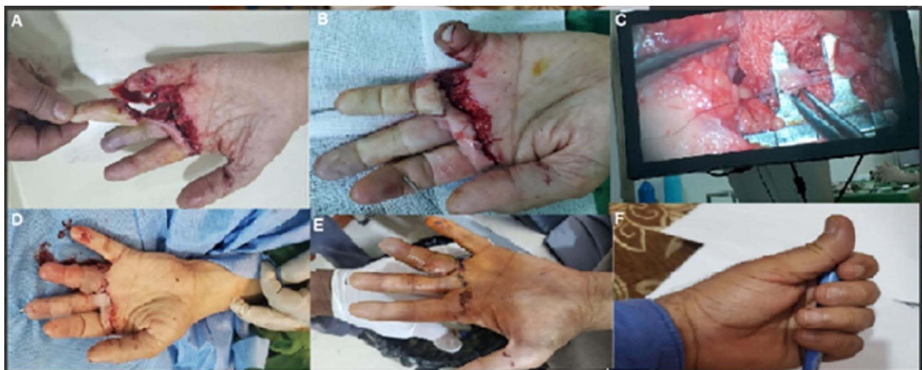
Figure 1 Index and middle fingers amputation and devascularization (A). Bone fixation by K-wires (B). Microvascular anastomosis, two digital arteries, one dorsal vein, and two digital nerves for each finger (C). Post-operative finger appearance (D), on the third postoperative day (E). Showing accepted finger grasp function (F).

To define the functional outcomes, patient satisfaction, digit mobility (motor functions), and digit sensitivity (sensory functions) were assessed. The total active motion (TAM) of the metacarpophalangeal (MCP), proximal interphalangeal (PIP),