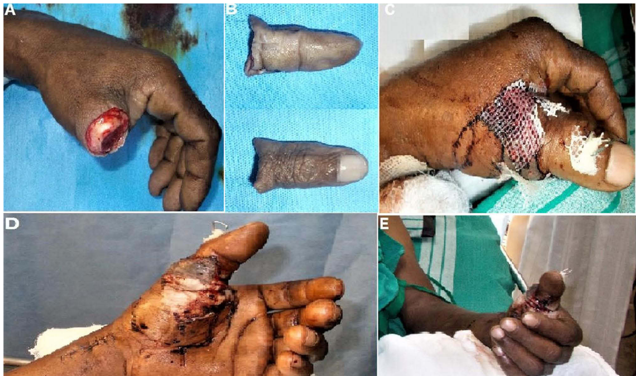
Figure 3 Thumb fingertip amputation beyond the Middle phalanx joint (A). Amputated finger (B). Reattached the finger using one vein repair and one vein graft (C). Postoperative finger appearance (D). 5 th -week postoperative appearance (E).