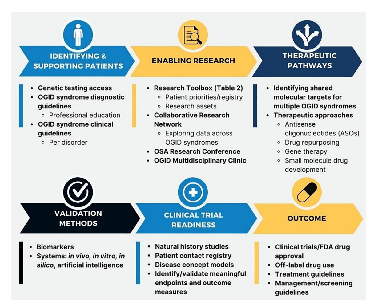
Figure 2. OSA Research Roadmap. The OSA has developed a comprehensive roadmap for OGID syndromes. This roadmap was created using shared learning from the Malan Syndrome Foundation and TBRS Community. It may also serve as a template for other OGID syndrome patient advocacy organizations. OGID, overgrowth-intellectual disability; OSA, Overgrowth Syndromes Alliance; Food and Drug Administration (FDA).

in conjunction with registry data provide a robust resource for research on the disorder. Universal unique identification codes, such as the Global Unique Identifiers<sup>42</sup> and the Clinical Research ID,<sup>43</sup> can be used to link de-identified biosamples to patient data repositories and other studies.