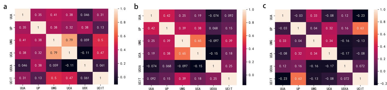
Figure 1. Association between stone components and urine chemicals were conducted in the single calcium oxalate group (a), mixed calcium oxalate group (b) and other stone group (c), respectively. P values were shown in the chart. The figure was performed using Python software version 3.8 ( https://www.python.org/ ).

Multivariate logistic analysis of the risk factors. In each group, the presence or absence of calculi (1 = yes, 0 = no) was considered the dependent variable, and urinary uric acid, urinary phosphorus, urinary magnesium, urinary calcium, urinary oxalic acid, and urinary citric acid were considered the independent variables for the multifactor logistic regression analysis. Decreased urinary magnesium and uric oxalic acid were independent risk factors in the multivariate logistic analysis of all cases and normal controls (Fig. 2a and Supplementary Table S1). Only reduced urinary magnesium was found to be a risk factor in the multivariate analysis of the single calcium oxalate group and normal control group (Fig. 2b and Supplementary Table S2). Decreased urinary magnesium and uric oxalic acid were shown as risk factors in the multivariate analysis in the mixed calcium oxalate group and normal control group (Fig. 2c and Supplementary Table S3). No risk factors were identified in the multivariate logistic analysis in the other stone group and normal control group (Fig. 2d and Supplementary Table S4).