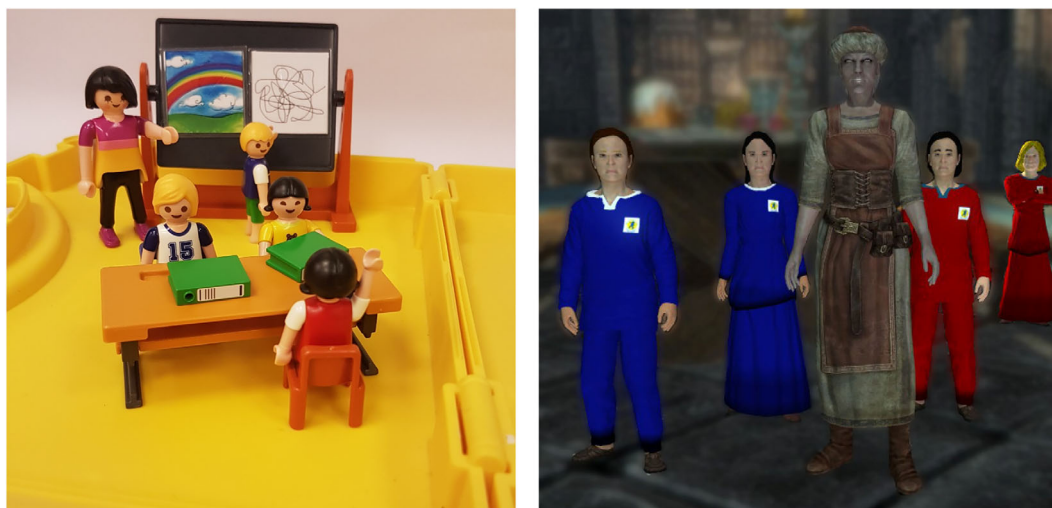
FIGURE 1 A selection of the characters that appear in the two contexts of play. The image on the left depicts the children and teacher from the Playmobil activity, and the image on the right depicts the children and Storyteller from the CAMGame

Free play with Playmobil figures. In the first home visit, after completing the social understanding tasks, the children were given an opportunity to play with Playmobil figures in any way they would like on their own for 3 minutes (see Figure 1). Experimenters were encouraged to engage with the children's play only at the child's request (see Paine et al., 2019a, for more details). Available Playmobil included all sets and figures that had been used in the preceding