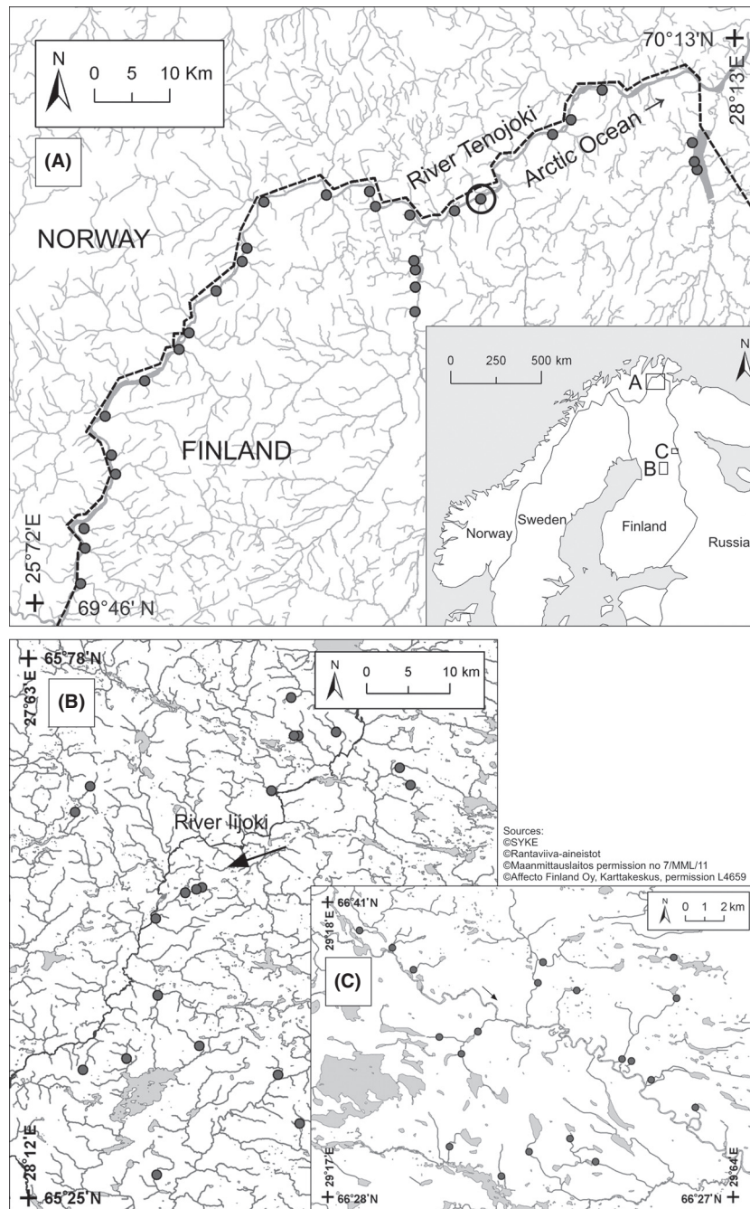
Figure 1. Map of the three study areas (Heino et al. 2014): (A) Tenojoki, (B) Iijoki, and (C) Koutajoki. Note that all the study sites are located in tributaries, although due to the resolution of the map, some sites seem to be located in the main channel of the River Tenojoki. The circle in the uppermost map denotes two sites that are located very close to each other.

At each site, a kick-net (net mesh size 0.3 mm) sample representing a riffle of approximately 100 m 2 was taken (for more details, see Heino et al. 2014; and Heino 2013). Four 30-sec per one-meter subsamples divided among the different microhabitats (based on variation in velocity, depth, moss cover, and particle size) were taken