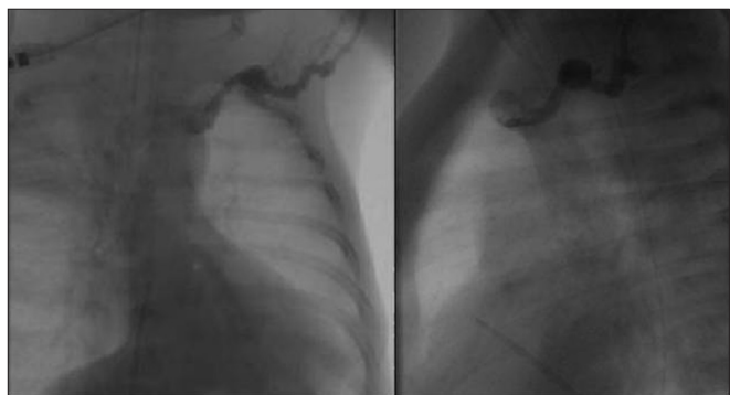
Figure 4: Antero-posterior and lateral views of angiograms; after dye injection in a peripheral vein in the left arm. It showed that the left innominate vein drain into the right superior vena cava which in turn drain to the posterior left atrium

injection in a peripheral vein in the left arm showed draining of the left innominate vein to the RSVC and consequently into the posterior LA [Figure 4]. It also delineated the presence of MAPCAs originating from the descending aorta and joining the hypoplastic pulmonary arterial tree. There were also two stenotic sites at the proximal parts of the pulmonary artery branches and normal pulmonary venous pattern