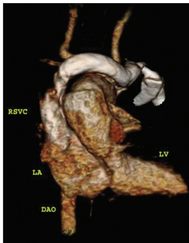
Figure 3: Multiplanar computerized reconstruction of cardiac computerized tomography angiogram showed the left innominate vein drain into the right superior vena cava which in turn drain to the posterior left atrium