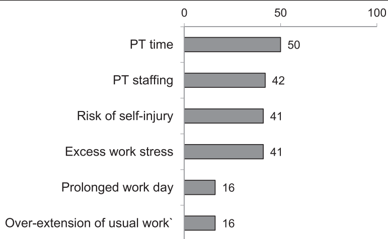
Figure 3 Physical therapist (PT) reported barriers to early mobilization of critically ill patients (n = 12, % reporting agree).

experience with EM were not associated with greater report of potential benefits across groups of MICU clinicians. Clinicians across all fields (physicians, nurses and PTs) reported acceptance of EM as a therapy in patients requiring MV, while most reported disagreement with use of EM in patients on vasoactive agents. Studies of patients receiving EM demonstrate that mobility is safe and feasible in patients on stable dose of vasoactive agents with very few adverse events [7,11,15,24]. Further targeted education around appropriate patient selection and the role of mobility in patients with stable shock may enhance clinician acceptance of mobility in this subgroup of patients.