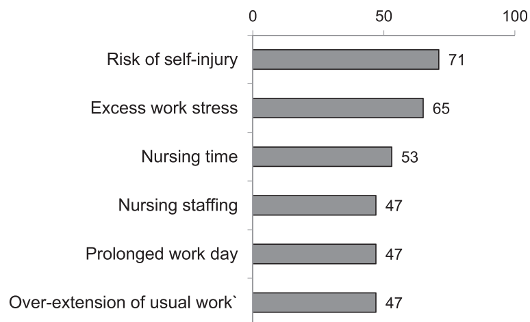
Figure 2 Nursing reported barriers to early mobilization of critically ill patients (n = 17, % reporting agree).

Our study is the first to directly survey the full MICU care team involved in implementation of early mobilization (physicians, nurses and physical therapists) regarding knowledge and perceived barriers towards EM in critically ill patients. We targeted clinicians involved in patient care in the MICU given that the largest body of literature around EM to date exist for medical ICU patients, particularly patients diagnosed with respiratory failure [7,11,15]. We found that most clinicians (nurses, physical therapists and physicians) are knowledgeable regarding the potential benefits of EM including reductions in duration of mechanical ventilation and maintenance of muscle strength. Duration of employment and prior