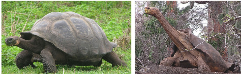
Figure 1. Saddleback (right) and domed (left) shell morphotypes in Galápagos giant tortoises.

been reported in Galápagos giant tortoises 19–21 , its existence does not necessarily imply evolutionary causation, as habitat selection may be a consequence rather than a cause of shell shape evolution.