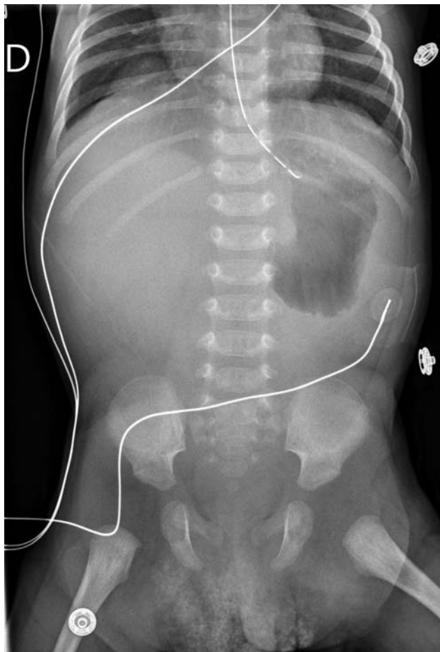
Fig. 1 Dilated stomach at 5 weeks of age.

The 5.5-week-old boy was finally taken back to the operating room (OR) for an open explorative laparotomy, during which a single 5-mm trocar was inserted into the