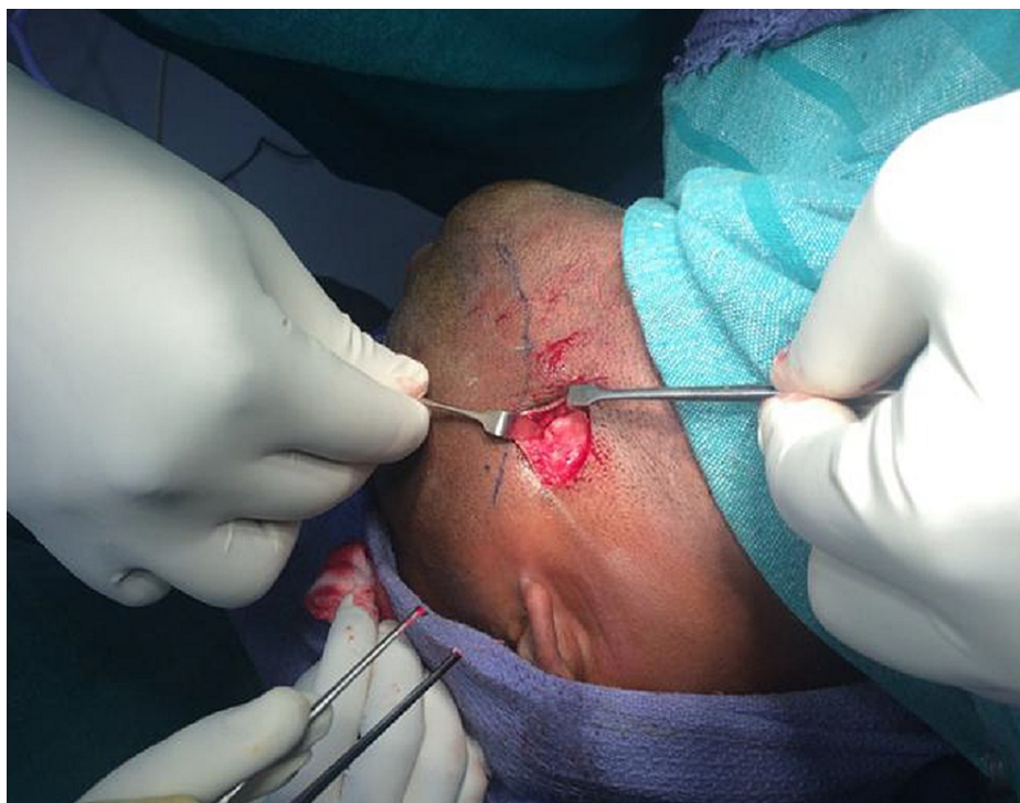
FIGURE 3: Platysma muscle beneath the subconnective tissue (Patient 1)

The retromandibular transmasseteric approach was used to avoid damage to the facial nerve. The incision was placed 0.5 cm below the earlobe and continued inferiorly for 5 cm. It was placed just behind the posterior border of the mandible and was extended below the level of the mandibular angle, depending on the extent of exposure desired according to the level of the fracture. The initial incision was carried out through the skin and subcutaneous tissues to the level of the platysma (Figure 3) [10].