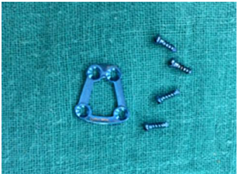
FIGURE 6: Trapezoidal three-dimensional (3D) plates with screws used in study

After checking for occlusion and ensuring the correct position of the condyle in the glenoid fossa, the surgical wound was irrigated with saline and betadine. Any associated mandibular fracture was opened through an intraoral approach and appropriate mini-plates were used for osteosynthesis as per Champy's