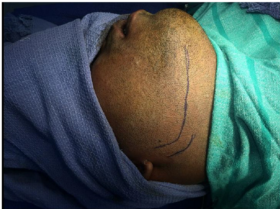
FIGURE 2: Surgical marking of retromandibular incision for transmasseteric approach to expose fractured subcondyle (Patient 1)

The retromandibular transmasseteric approach was used to avoid damage to the facial nerve. The incision was placed 0.5 cm below the earlobe and continued inferiorly for 5 cm. It was placed just behind the posterior border of the mandible and was extended below the level of the mandibular angle, depending on the extent of exposure desired according to the level of the fracture. The initial incision was carried out through the skin and subcutaneous tissues to the level of the platysma (Figure 3) [10].