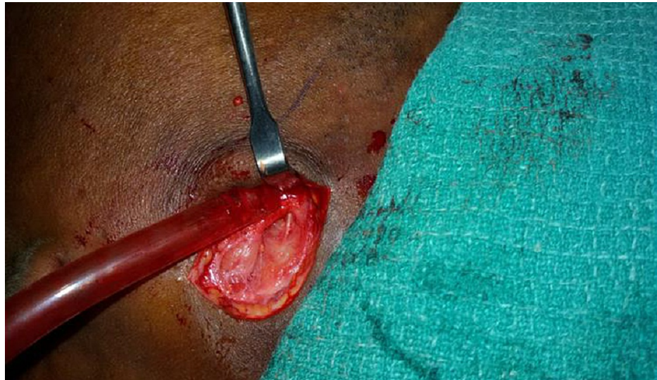
FIGURE 4: Marginal mandibular branch of the facial nerve (Patient 1)

The platysma muscle and superficial musculoaponeurotic system (SMAS) were incised in the vertical plane. A hemostat was spread open parallel to the anticipated direction of the facial nerve branches. Dissection was carried out and the marginal mandibular nerve was preserved when encountered (Figure 4) [10].