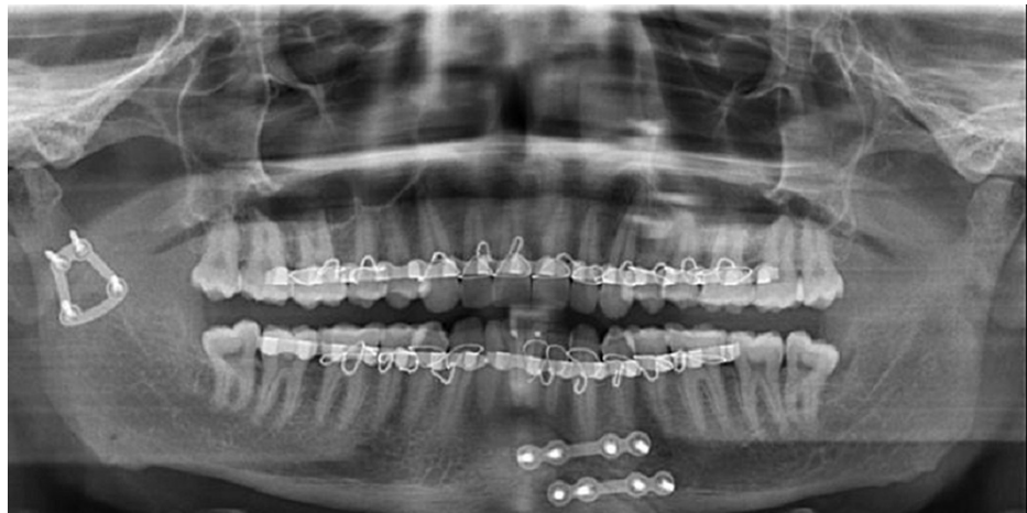
FIGURE 7: Postoperative OPG showing reduced fractured condylar component fixed with three-dimensional (3D) trapezoidal plate (Patient 1)

The patients were administered postoperative medications which included intravenous antibiotics and anti-inflammatory analgesics for a period of about five days to seven days, as well as maintaining adequate hydration status and nutritional requirements. A soft diet and physiotherapy were started on the first postoperative day. Patients were not kept under postoperative MMF. Sutures were removed between the 7th and 10th postoperative days. All the patients were advised to adhere to a soft diet for about three weeks postoperatively and instructed to maintain good oral hygiene. All patients were followed up postoperatively at one week, one month, three months, and six months. An OPG was taken to assess the osteosynthesis (Figures 7-8).