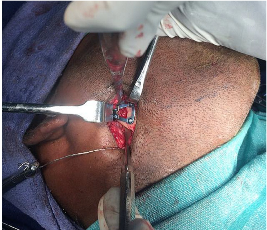
FIGURE 5: Fixation of three-dimensional (3D) trapezoidal plates to the fractured segments (Patient 1)