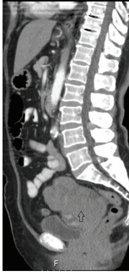
FIGURE 1: A CT scan showing a large mass of the left ovary.

Immunohistochemical evaluation showed strong staining for CD20 and bcl-2 (Figure 2). These same cells were negative for pan-cytokeratin, S-100, EMA, CD30, HMB-45, and inhibin. The diagnosis of diffuse large B-cell lymphoma was made. The patient was assessed as stage I BE according to the Ann Arbor system. Bone marrow examination could not be performed due to her poor general condition and chemotherapy was not started. The patient died because of disseminated intravascular coagulation on the postoperative fourteenth day.