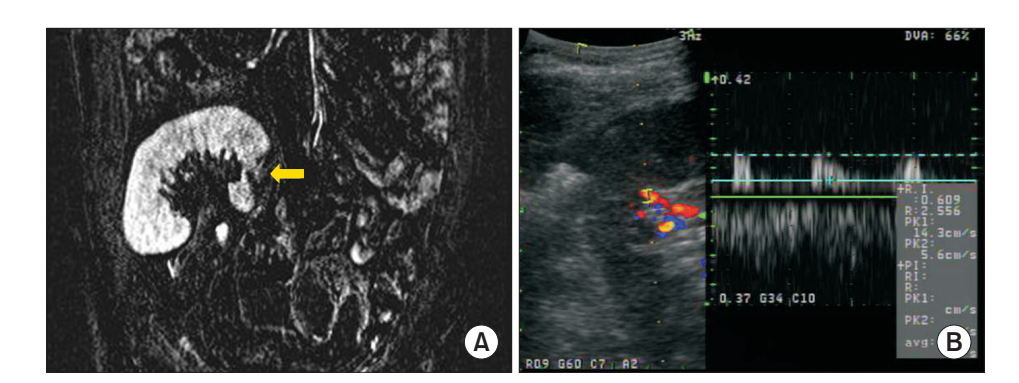
Fig. 2. Radiologic findings of the recipient. Focal wedge shaped perfusion defect in the upper pole of the transplanted kidney on flair images (arrow), coronal view of renal magnetic resonance angiography (A) and slightly decreased vascularity and perfusion in inferior pole of graft kidney on kidney Doppler ultrasonography (B). Peak systolic velocity of lower inter-lobar artery reduced to 14.3 cm/sec.

We reviewed the pretransplant examinations and renal CT angiogram showed an upper polar renal artery branch about 1 mm in diameter originating from the aorta and supplying the left kidney, but this finding was not previously mentioned by the radiologist (Fig. 1B). A surgeon informed us of an additional small-caliber polar renal artery